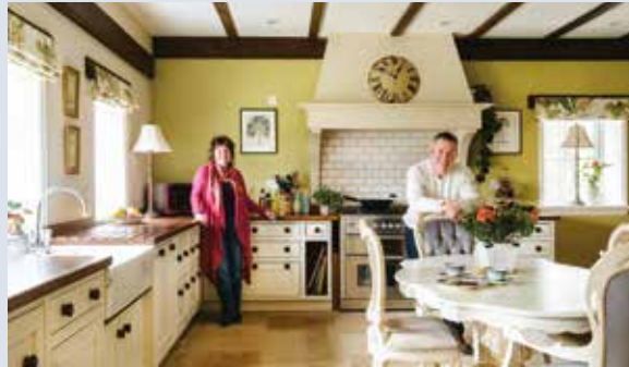
Affluent empty nesters