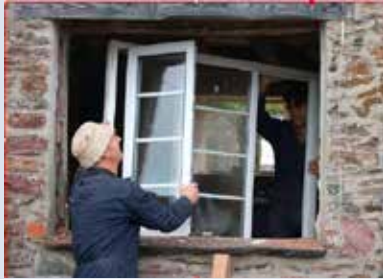
Hands-on self builders