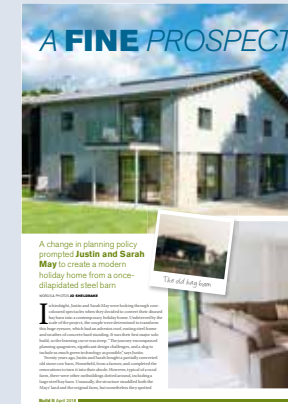
Learning from other self builders