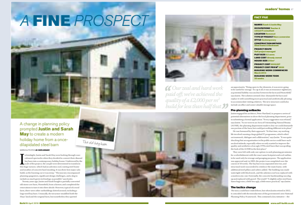
Learning from other self builders

94% of readers find adverts useful when specifying products